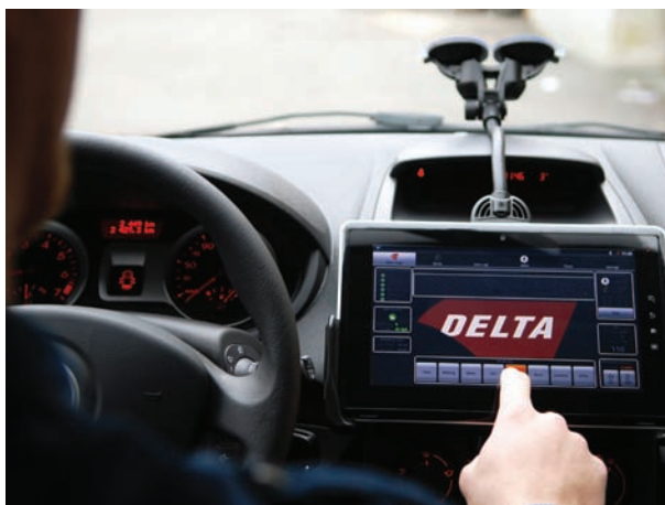
LTL-M GUI tablet PC

DELTA offers service of the instrument at its factory and re-calibration of the calibration unit at its DANAK-accredited laboratory.