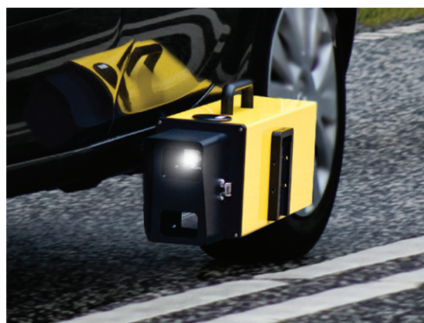
LTL-M mounted on a car

LTL-M illustration from the Danish Engineering magazine Ingeniøren